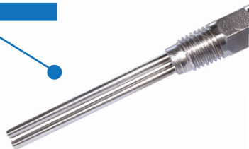
Flow Averaging Tube (FAT)