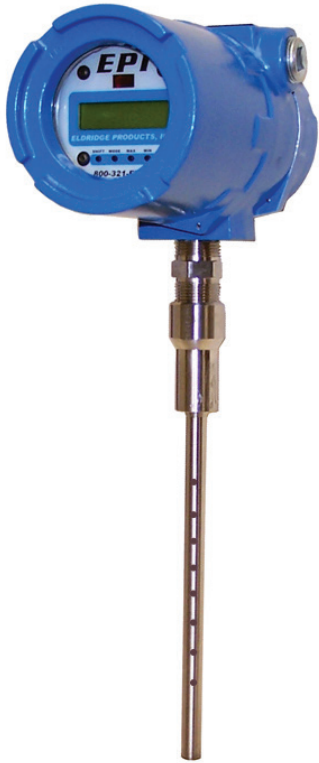
SERIES 9800MP FAT