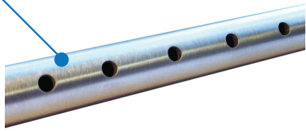
Flow Averaging Tubes ( FAT )