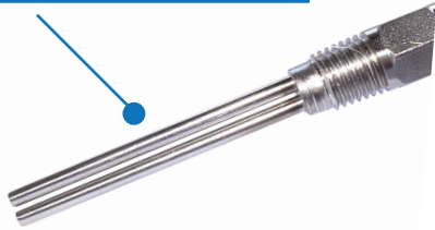
RTD's (Resistance Temperature Detectors)

Thermal mass flow meters use the principle of convective heat transfer to directly measure mass flow. EPI's proprietary thermal mass flow sensors use two precisely matched , reference-grade platinum Resistance Temperature Detectors (RTDs) . The sensor elements are hermetically sealed in 316L Stainless Steel (or optional Hastelloy C276) thin wall sheaths. Our microcontroller operated smart sensor technology preferentially heats one RTD; the other RTD acts as the temperature reference. The process gas flow dissipates heat from the first RTD, causing an increase in the power required to maintain a balance between the RTDs. This increase is directly related to the molecular gas flow rate. Our sensors are temperature compensated for a wide process gas temperature range and insensitive to pressure changes, therefore the flow meter output signal is a true direct mass flow rate value.