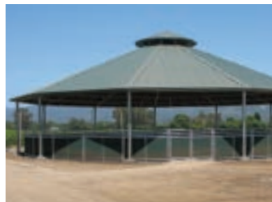
Round Pens and Covers