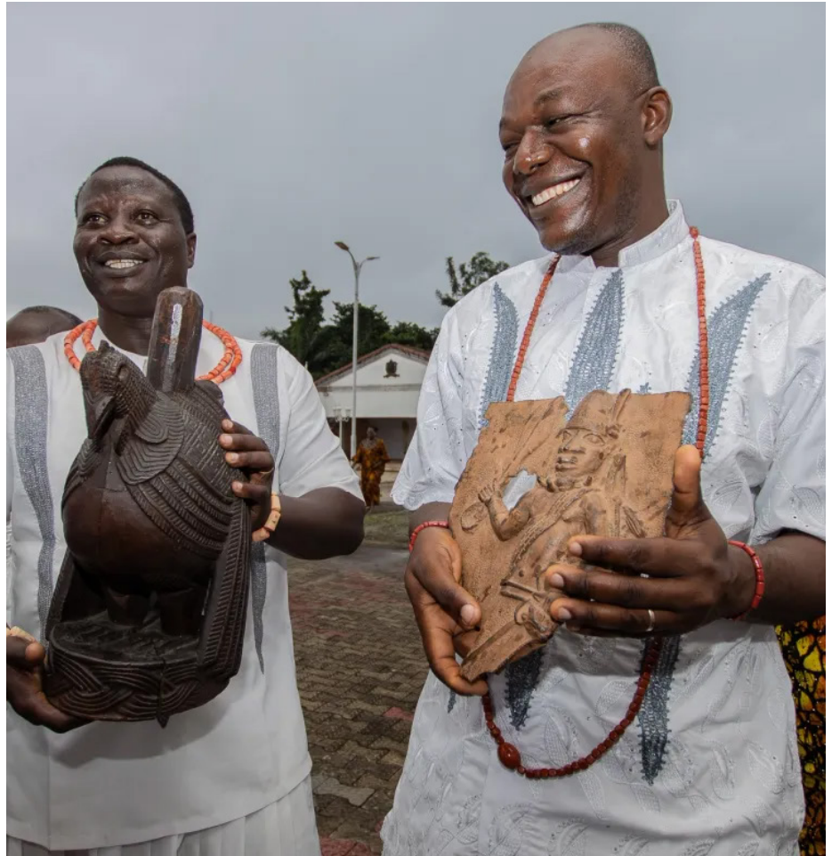
Court officials carrying the Benin Bronzes during the restitution ceremony.

The University of Iowa Stanley Museum of Art has returned two Benin bronzes to the Oba of Benin, the first time a US museum has handed back works to the head of the former royal family of the Benin empire. In a ceremony on 15th July at the Benin Palace in Nigeria, the museum restituted two objects, a brass plaque and wooden altarpiece, to Oba Ewuare II.