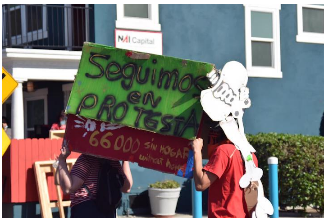
Documentation of the procession and protest "And Still We Rise / Seguimos en Protesta," March 28, 2021, organized by the L.A. Tenants Union.

While curatorial practice has allowed me to learn about historical and present-day movements, the learning processes that define LATU have encouraged me to see my surroundings differently, to understand my city through power relations and post-capitalist possibility. What is a future that understands housing as an essential human right? What is a future where communal needs and resources can no longer become privatized?