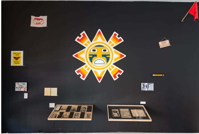
Installation view of the exhibition El Teatro Campesino (1965–1975) , June 28–August 13, 2017 at Los Angeles Contemporary Exhibitions (LACE).

mention a lot of poetry. With their alternative educational and political model in tow, they brought exploratory theater from farm to farm.