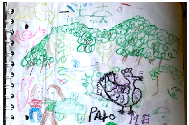
Collective drawing made with our votanes and local children in the Zapatista Autonomous Territories, 2014.

What does a world with many worlds working together look like?