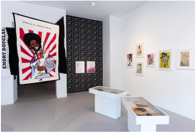
Installation view of the exhibition Emory Douglas: Bold Visual Language , July 8–August 26, 2018 at Los Angeles Contemporary Exhibitions (LACE).