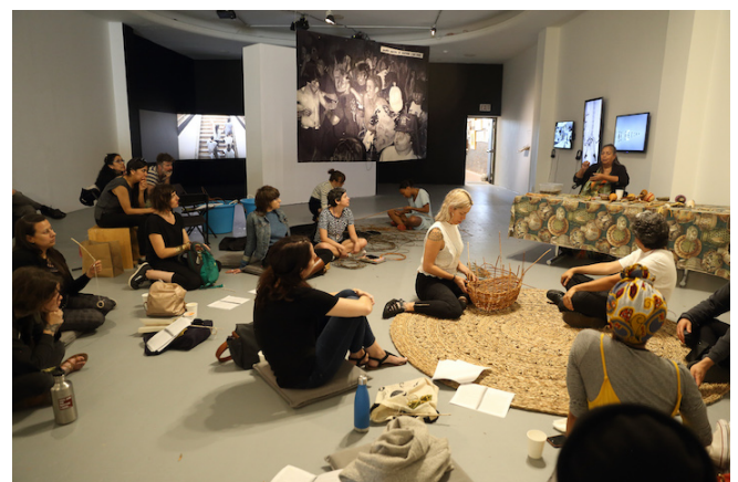
Documentation of Ensayos Libertarios: Maaynok ( Libertarian Essays: Making) at Los Angeles Contemporary Exhibitions (LACE), as part of Unraveling Collective Forms, 2019.

I curate as an active member of a society dismembered by violence, approaching all of what I have described as a questioning process. Right after finishing the Escuelita, I was unsure of what to do with what I had learned, of what to do with the girl's mysterious going-away present. After a long, meditative trip back to L.A., I realized that they were seeds, revolutionary seeds, to be planted and cultivated in the tierra that I share with everyone.