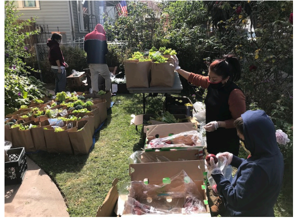
Documentation of a food distribution event put on by the Second Street Tenants Association as part of the Unión de Vecinos–East Side local of the L.A. Tenants Union.

education to know your rights and support for asserting them in recognition that the government was not going to do anything substantial to protect people.