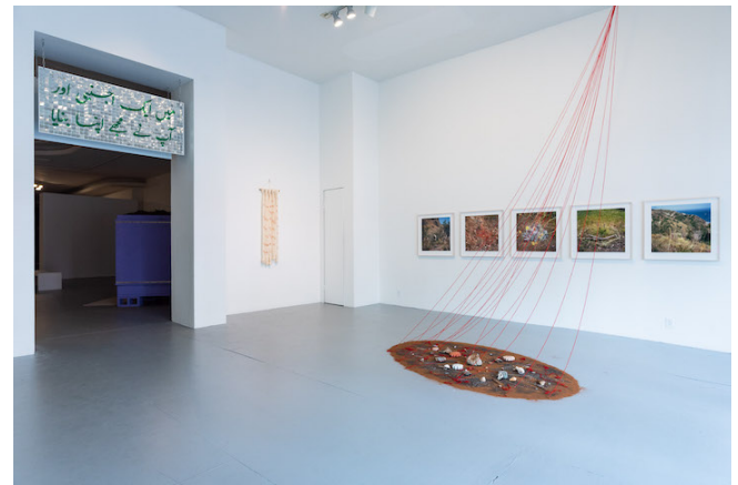
Installation view of the exhibition Unraveling Collective Forms , April 3–May 25, 2019 at Los Angeles Contemporary Exhibitions (LACE).

community, I hold dear the insistence of the radical artist and art historian Mariana Botey [now Mariana Wardell—Eds.] that we must "redefine and push art in its inflection as an immanent field of transformation of the order of imagination, subjectivity, critique, and truth and live it as a space of expression of freedom." 12