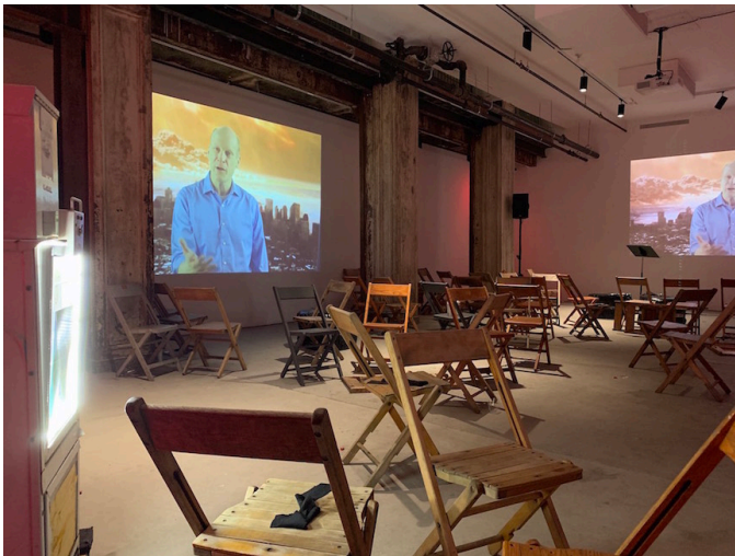
New Red Order, “New Red Order: Informants Get Paid!,” a public assembly at Artists Space, January 23, 2020.