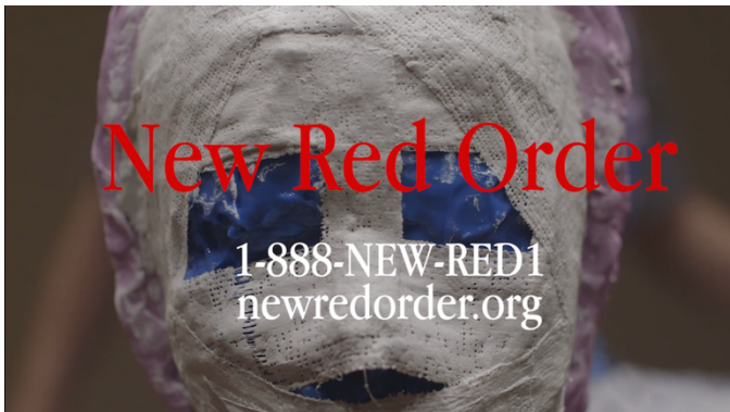
New Red Order, Never Settle , 2019, Digital video still.