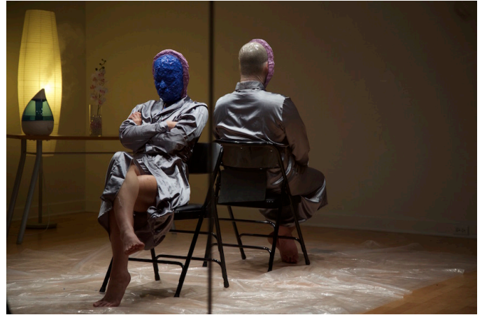
New Red Order, Never Settle , 2019, digital video still.

participation and engagement outside of ourselves.