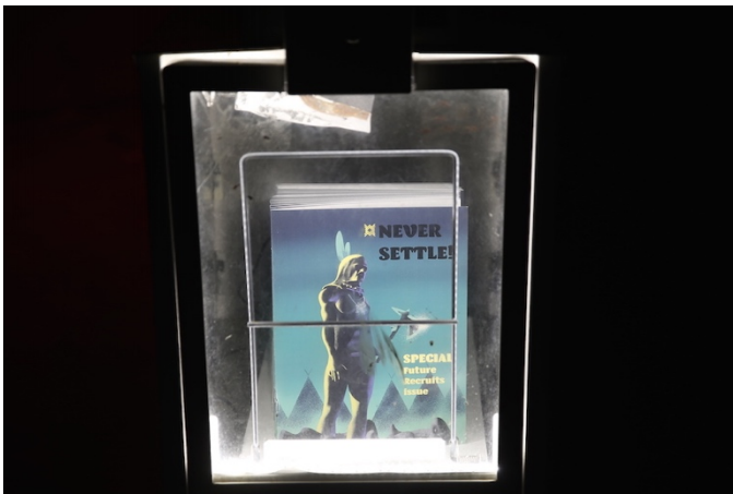
New Red Order, “New Red Order: Informants Get Paid!,” a public assembly at Artists Space, January 23, 2020.

publication, Special Future Recruits Issue (2019), a graphic activity book that serves as an educational tool for students to think about settler colonial relations in a digestible and comical way. In the past, THE INFORMANTS (2017–18), a rotating cast of characters explored stereotypes such as “playing Indian,” as you’d mentioned, and examined those desires for indigeneity through video and performance-based events. You’ve also discussed how you incorporate a tradition of sly Indigenous critique in your work to build relations with your audience while making explicit the histories of erasure.