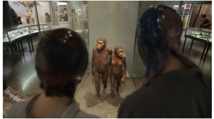
New Red Order, CULTURE CAPTURE: TERMINAL ADDITION , 2019, digital video still.

Part of “culture capture” is to deploy, in visual forms, the absurdity of that kind of endeavor, that those objects can retain value for Native people in this virtual space. At the same time, it’s holding the possibility that they may retain value if they can be manipulated and accessed by both Native—and even potentially more problematic—non-Native people. In The Violence of Civilization without Secrets , we were engaging in our own “salvage ethnography” of that particular institution. It was a hundred-year-old hall, about to be dismantled and reimaged. We captured it at the time when it still existed, which is similar to what those anthropologists were trying to do.