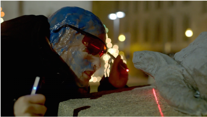
New Red Order, CULTURE CAPTURE: TERMINAL ADDITION , 2019, digital video still.

Many of your works stress the NRO's position that it's essential to take back from the museum and confront desires for an irretrievable past. That "culture capture" is a small, speculative step toward rectifying the violence committed by museum archives and the settler colonial icons that guard them. This idea also comes up in your 2017 film collaboration, THE VIOLENCE OF A CIVILIZATION WITHOUT A SECRET , where once again we see these objects and remains displayed and essentially frozen in institutions, while masked characters move through and usurp these spaces. Does the NRO consider these informants to be functioning as bandits or hackers who digitally free these Indigenous objects from their museum confines?