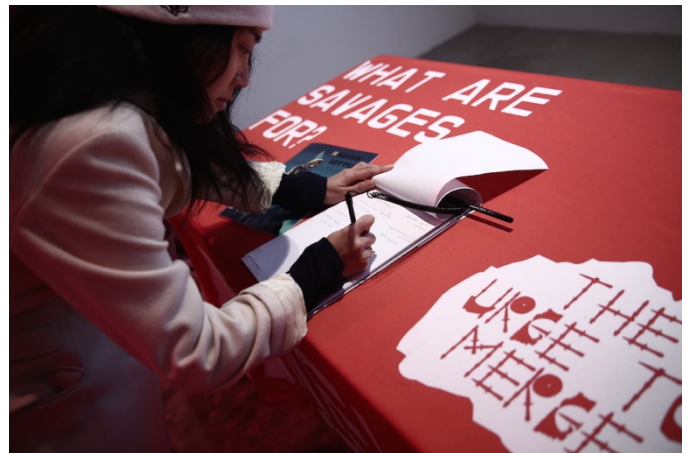
New Red Order, “New Red Order: Informants Get Paid!,” a public assembly at Artists Space, January 23, 2020.

indigeneity. Potential recruits are playfully asked: “Do you want to realize your fullest potential? Be your truest self? Act with confidence? Alleviate anxiety? Experience clarity? Be a part of the solution?” Those interested are told what they’ll actually do: “Learn to identify the desire for indigeneity in the myths, dreams, and political foundations of the so-called Americas. Learn to accept and re-channel your desire without letting your reflexivity get in the way. Start a lifelong process of Informing that allows for greater reciprocity.” 8 Can you speak more about which discourses you’re borrowing from?