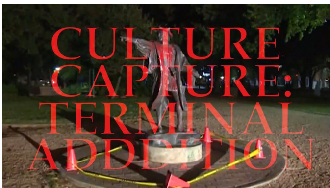
New Red Order, CULTURE CAPTURE: TERMINAL ADDITION , 2019, digital video still.

JP: Through acts of capturing, people can “freeze” these monuments in time in a way that externalizes them, making it possible to imagine the altering of their reality. This introduces a recurrence or extension of salvage modes of ethnography or anthropology. Those who externalize the capture, whether by doing it or viewing the results, participate in the thought or fear that the captured object might disappear, and then they might be drawn in or implicated in their material disappearance.