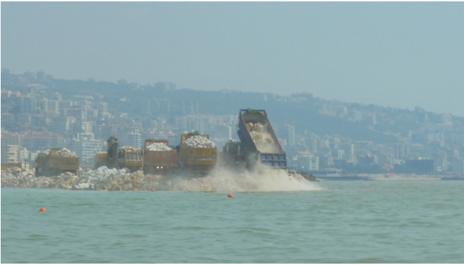
Marwa Arsanios, Falling is not collapsing, falling is extending , digital video (still), 2016.