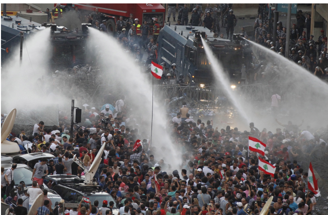
Lebanese protesters during a demonstration against the government, near Prime Minister Tammam Salam's offices, Beirut. From "'You Stink' campaign decries more than garbage buildup in Beirut," PBS.org, August 23, 2015.

deliver a workable solution. 11 Residents began to interrogate the state at all levels and organized sit-ins at the Ministry of the Environment to demand the resignation of its leader, Mohammed Mashnuq. Riots soon broke out, and Lebanon's military rushed in to silence the protestors with violence. August 19, 2015, was a significant turning point in the movement as soldiers openly repressed the "You Stink!" manifestations and many were physically detained, videos of which went viral. Officials pressed charges against the activists, but the online depository of videos produced and effectively circulated by citizen journalists and interested parties were critical for the movement's defense.