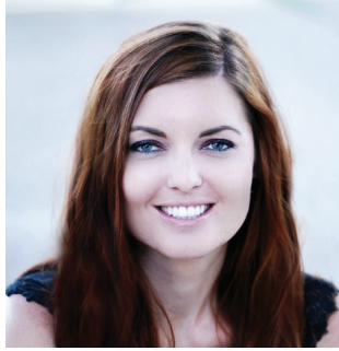
SIERRA 619 933 3208