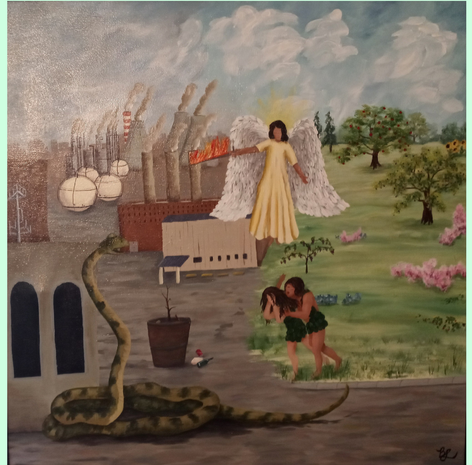
"The Expulsion" 36"x36" acrylic on canvas

But we as a species seem determined to ravage the magnificence of the environment we depend on, and are ultimately doomed to destroy it if changes are not rapidly made. Will our frantic lust for bigger, faster, more powerful objects seal mankind's doom? Are we determined to keep taking bite after bite from the fatal apple? Perhaps the snake knows.