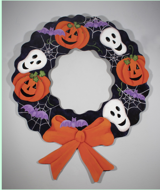
reversible 4 ft. wreath

I do original decorative painting on lots of different surfaces