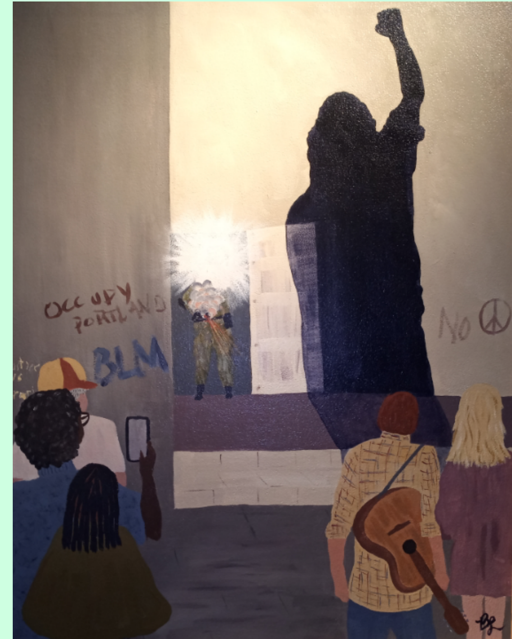
"Lady Liberty" 24"x30" acrylic on canvas

On the night when armed federal troops first stormed upon unarmed Black Lives Matter protesters, the larger-than-life shadow of my daughter loomed over their doorway, with her fist defiantly raised. The image showed up in pictures and video broadcasts worldwide, and I decided that it needed to be committed to canvas as well. I created my own multicultural group of spectators and incorporated the peace sign and guitar player in a plaid shirt from my own rebellious youth, making a multigenerational statement for freedom fighters everywhere.