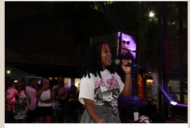
HUMOR & HARMONY WEEKEND'S FAN FEST