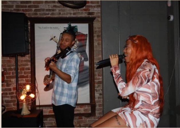
MISSING LINK SHOWS 2022-2023