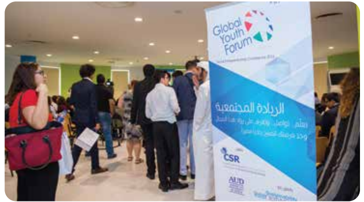
Registration - Day 1 - AUD