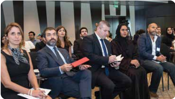
Judging Panel - Day 2 - Dubai Chamber