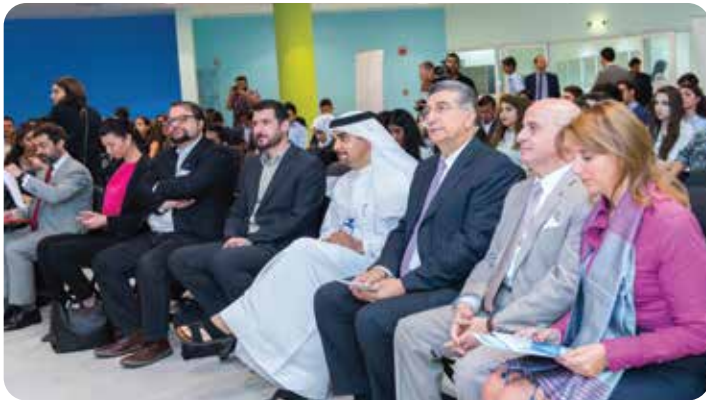
During opening ceremony - Day 1 - AUD