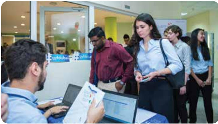
Registration - Day 1 - AUD