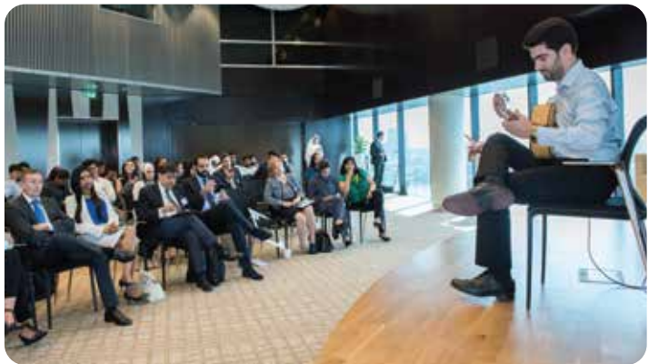
Musical entertainment break - Day 2 - Dubai Chamber