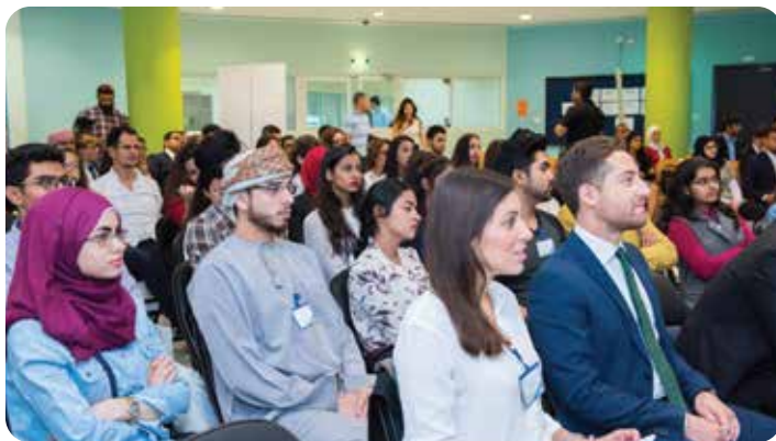
During one of the first session - Day 1 - AUD