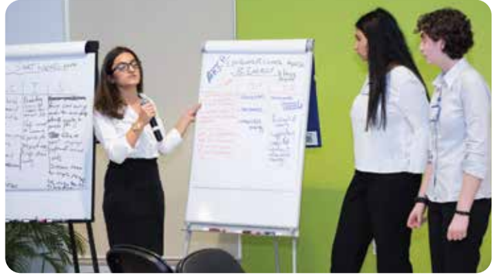
Students presenting during one of the workshops