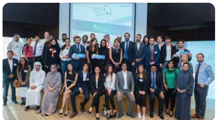
Closing Group Photo - Day 2 - Dubai Chamber