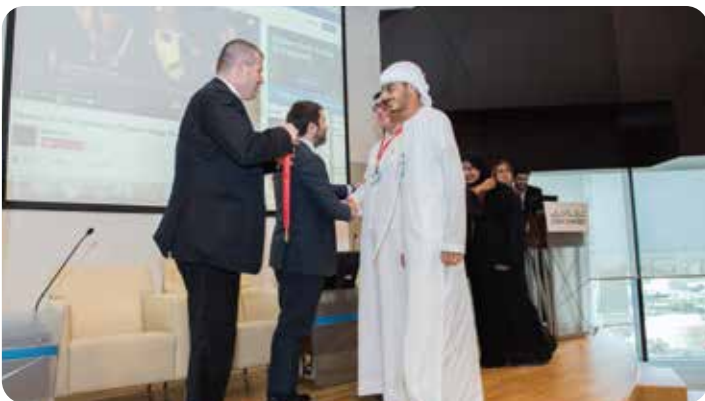
Awarding the winners of the GYF