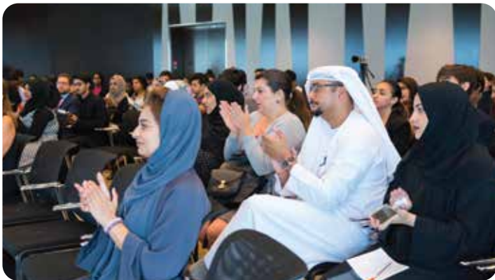
During of the panel sessions - Day 2 - Dubai Chamber