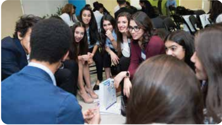
Students group work during one of the workshops