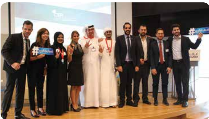
Al Ahli Holding Group CSR Team with the GYF winners