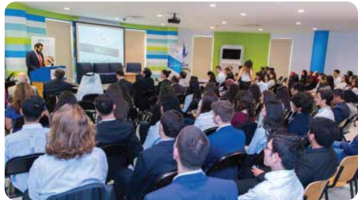
During opening ceremony - Day 1 - AUD