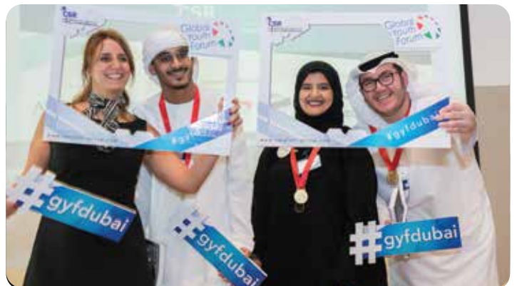
Khazaen Team - GYF 2016 Winners with Al Ahli Holding Group CSR Director