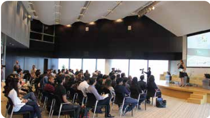
During opening ceremony - Day 2 - Dubai Chamber