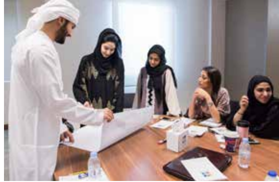
Group working during the session about how to build a social business.