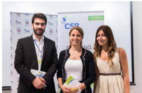
CSR Al Ahli Holding Group team