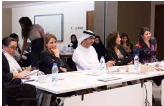
Participants presenting to the Jury panel.