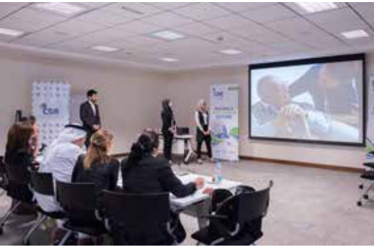
Participants presenting to the Jury panel.