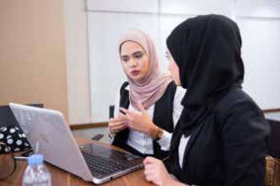
Participants working on their business idea.