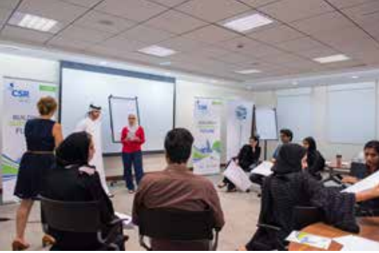
Participants presenting their project's mission and vision