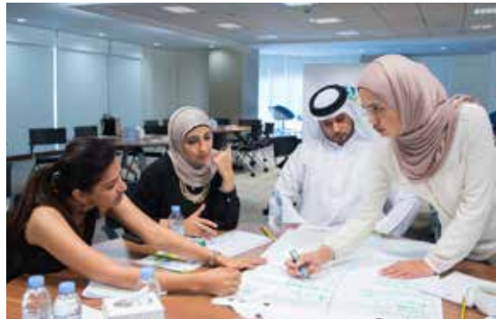
Group Working – Business Modeling