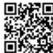
Search for the Meaning of Names