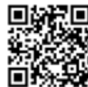
Search for the Meaning of Names