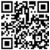
“Who is Jesus” Call and Response

On a piece of poster board, draw two columns. The first column should be labeled “Joys”. The second should be labeled “Disappointments”.