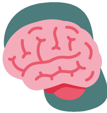
뇌 신경세포 대사 활성화