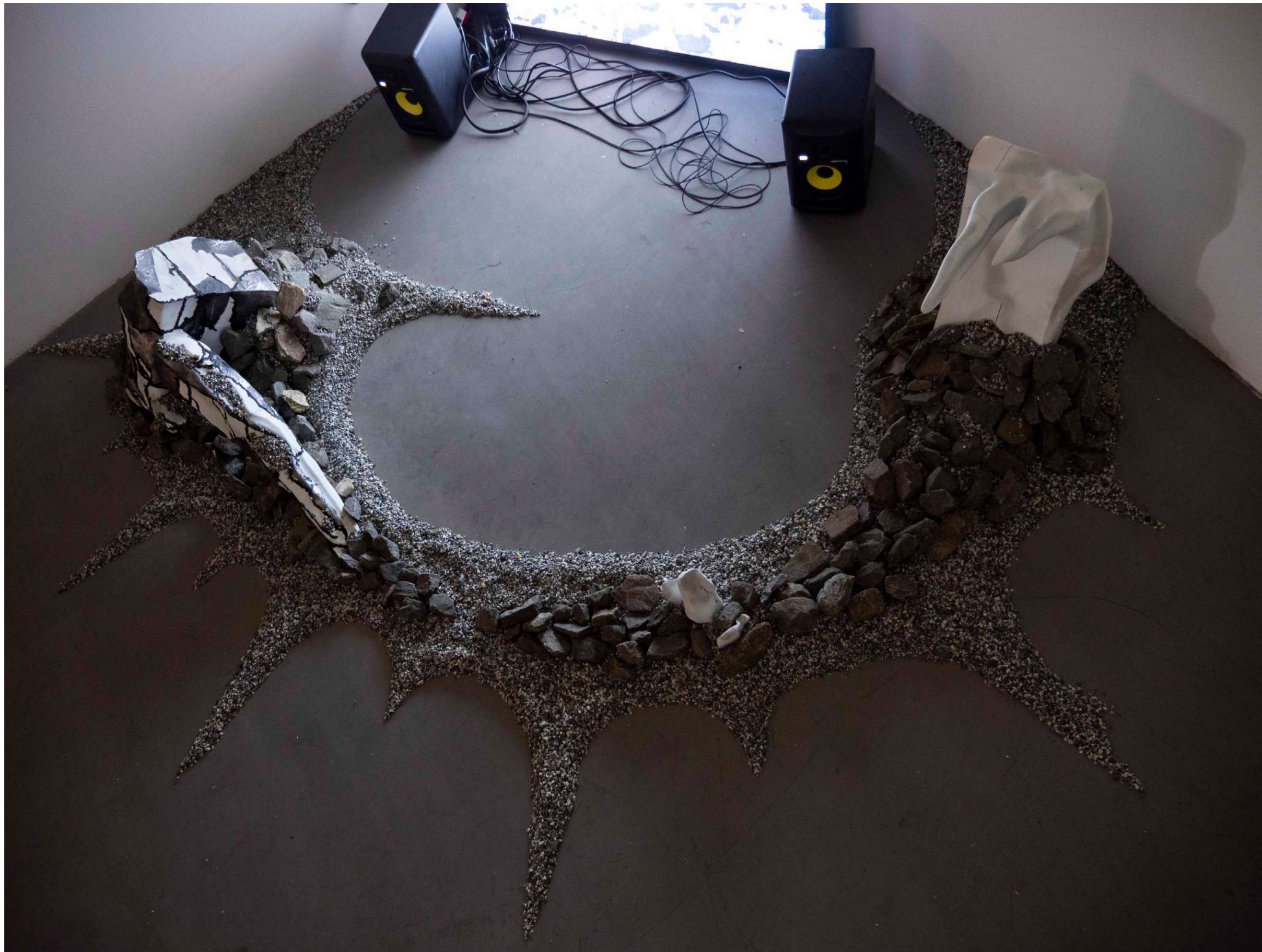
Installation view, credits: Andreas Aika Thomsen