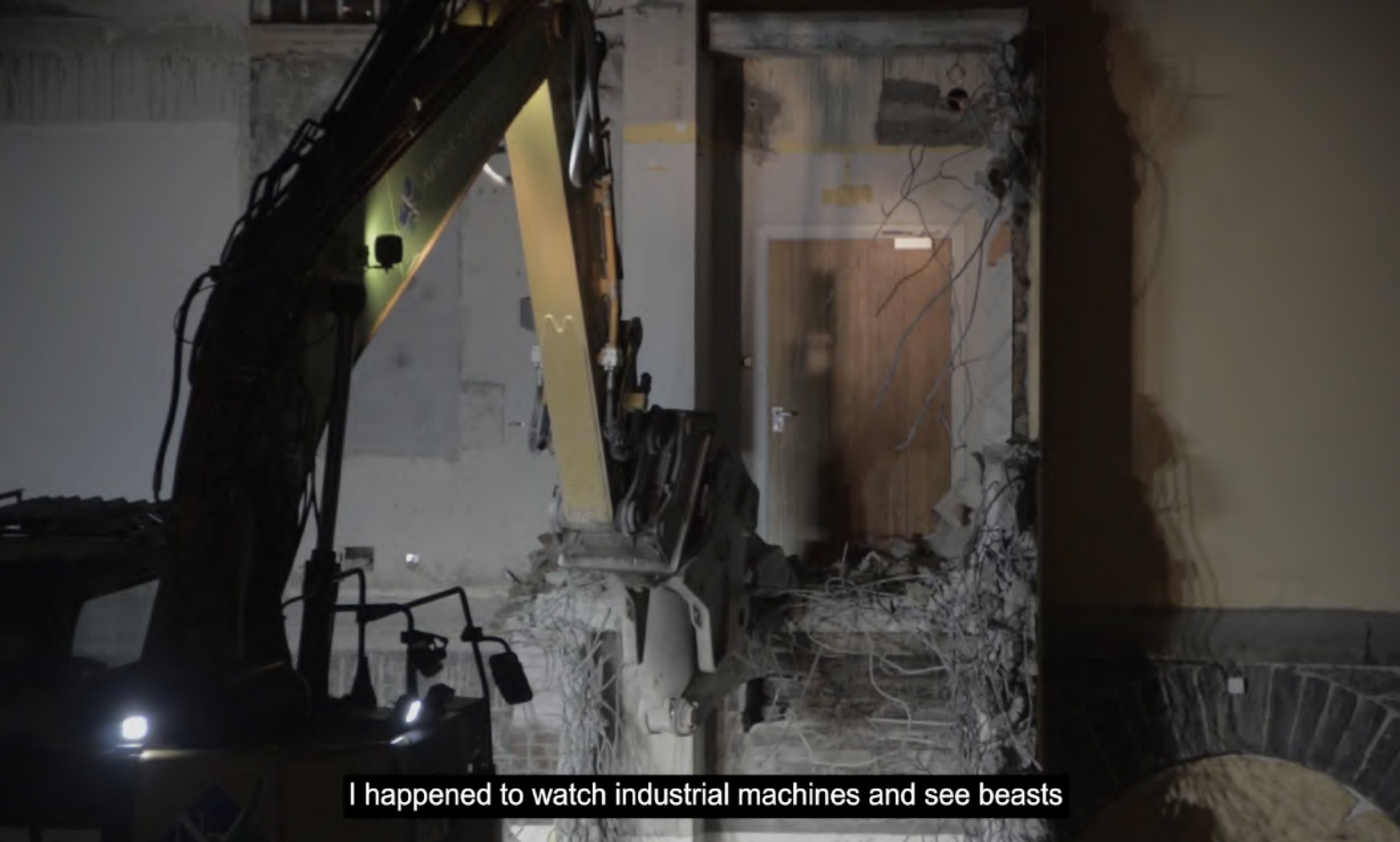
I happened to watch industrial machines and see beasts