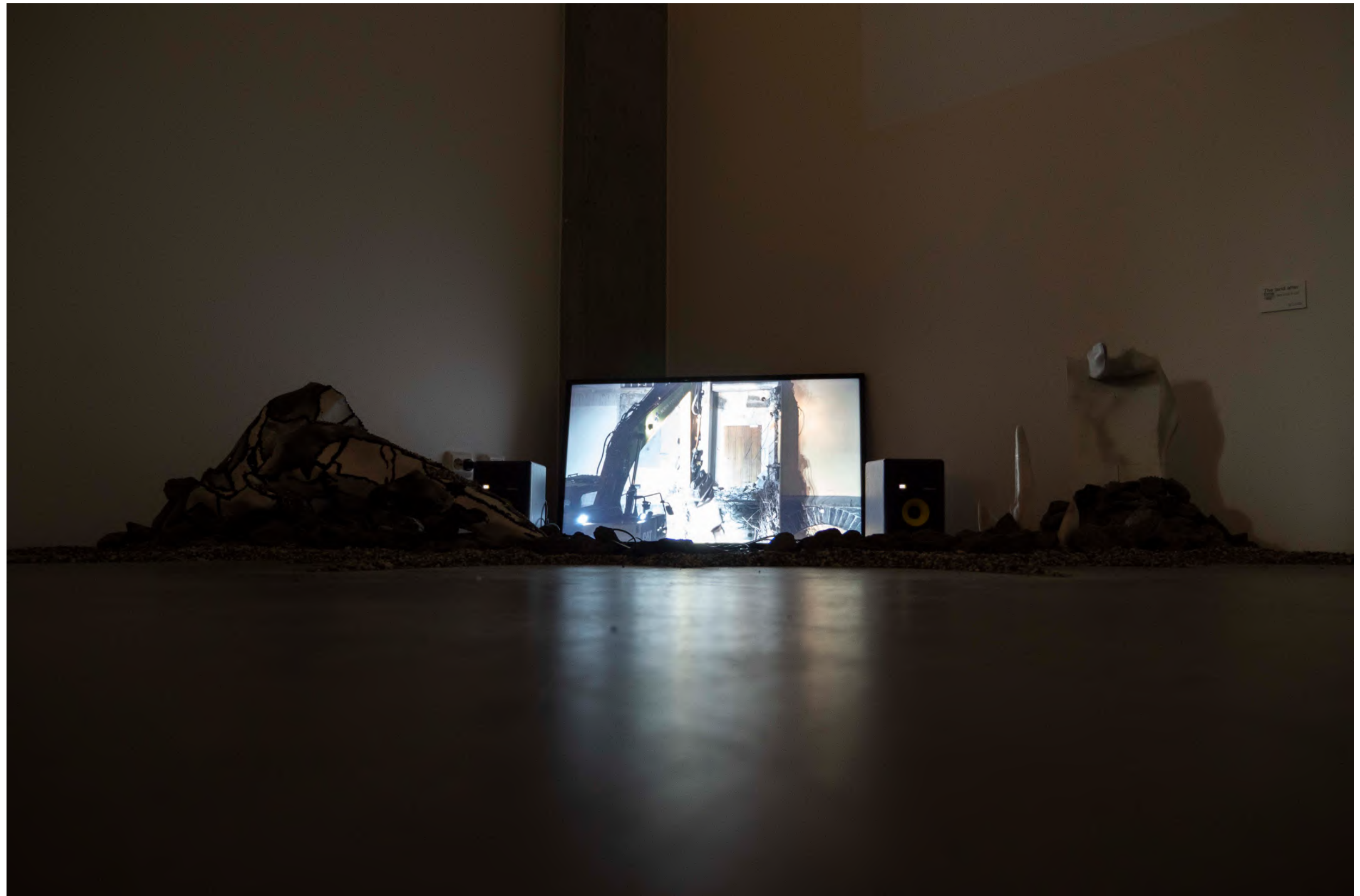
Installation view

The land after time is a video essay, made of original and found footage, thematically and visually divided in three parts. The concepts of time, memory and materiality tie the chapters together with the aid of the artist's recorded voice, which weaves a story between scientific facts and poetry.