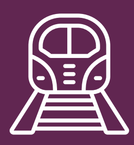
0.4km from Train Station