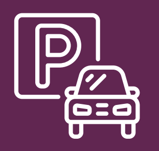
Limited parking available