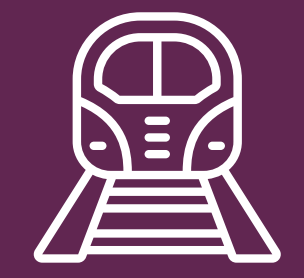
0.9km from Train Station