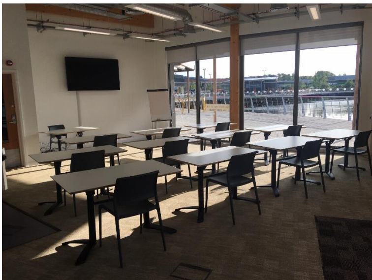
Image above shows Classroom layout

One table & chair per delegate set up facing front, appropriately spaced, with one person delivering from the front. Example image below: