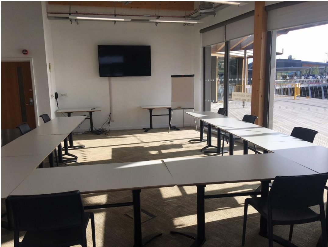
Image above shows U-Shape layout