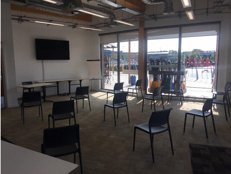
Image above shows Theatre layout

Rows of appropriately spaced chairs facing front, with 1 person delivering from the front. Example image below: