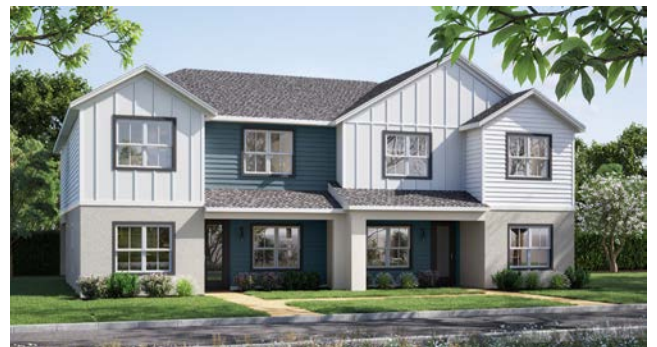
MODERN FARMHOUSE C