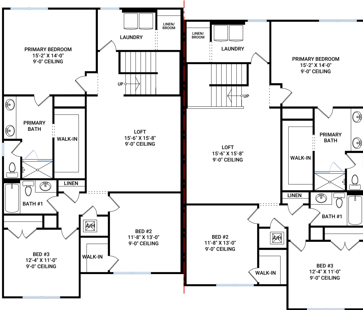
TIMBERLAND - UNIT 1