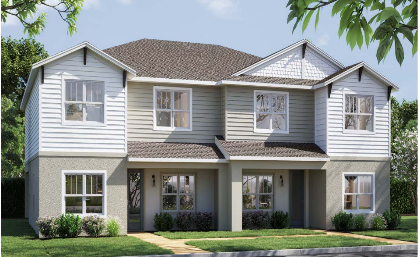
CRAFTSMAN CONTEMPORARY A