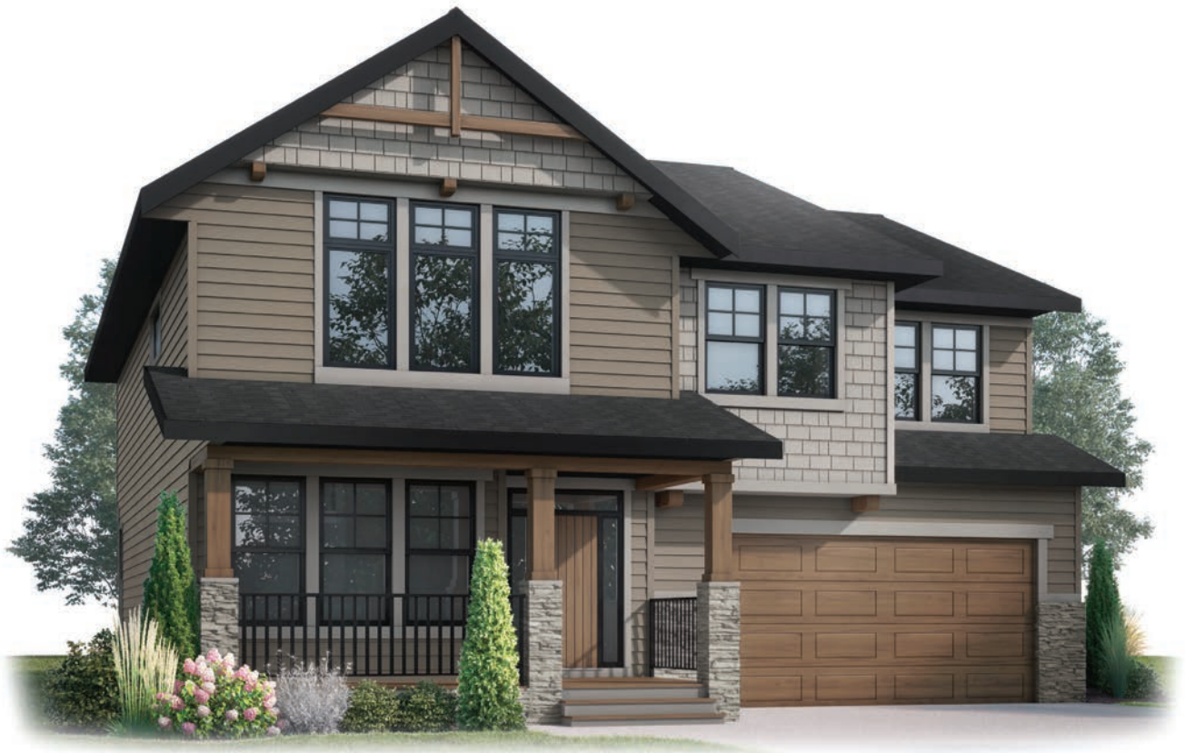
VINTAGE WIDE LANE AP1