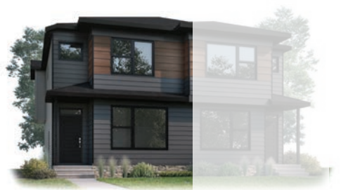
SL4 MODERN PRAIRIE