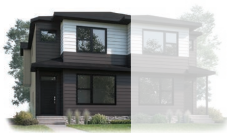
SL3 URBAN MOUNTAIN