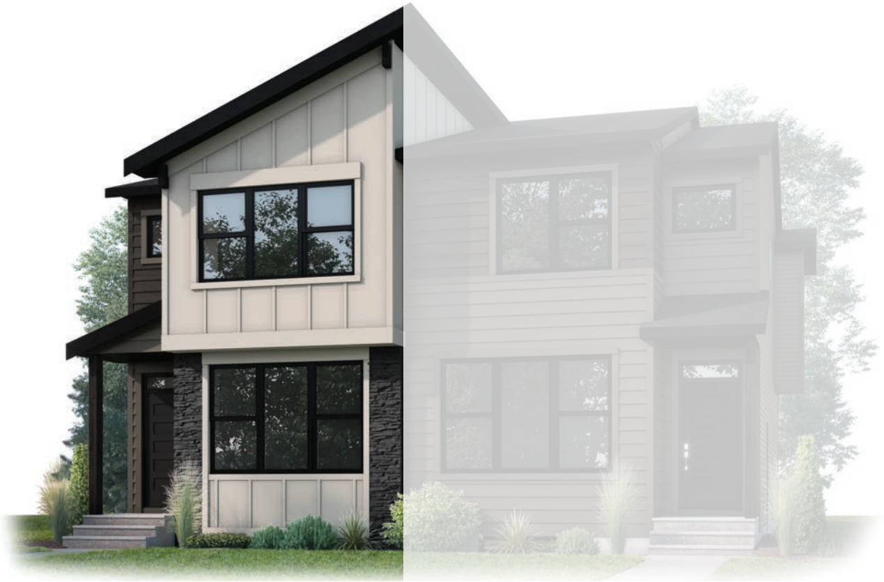
URBAN MOUNTAIN SL3