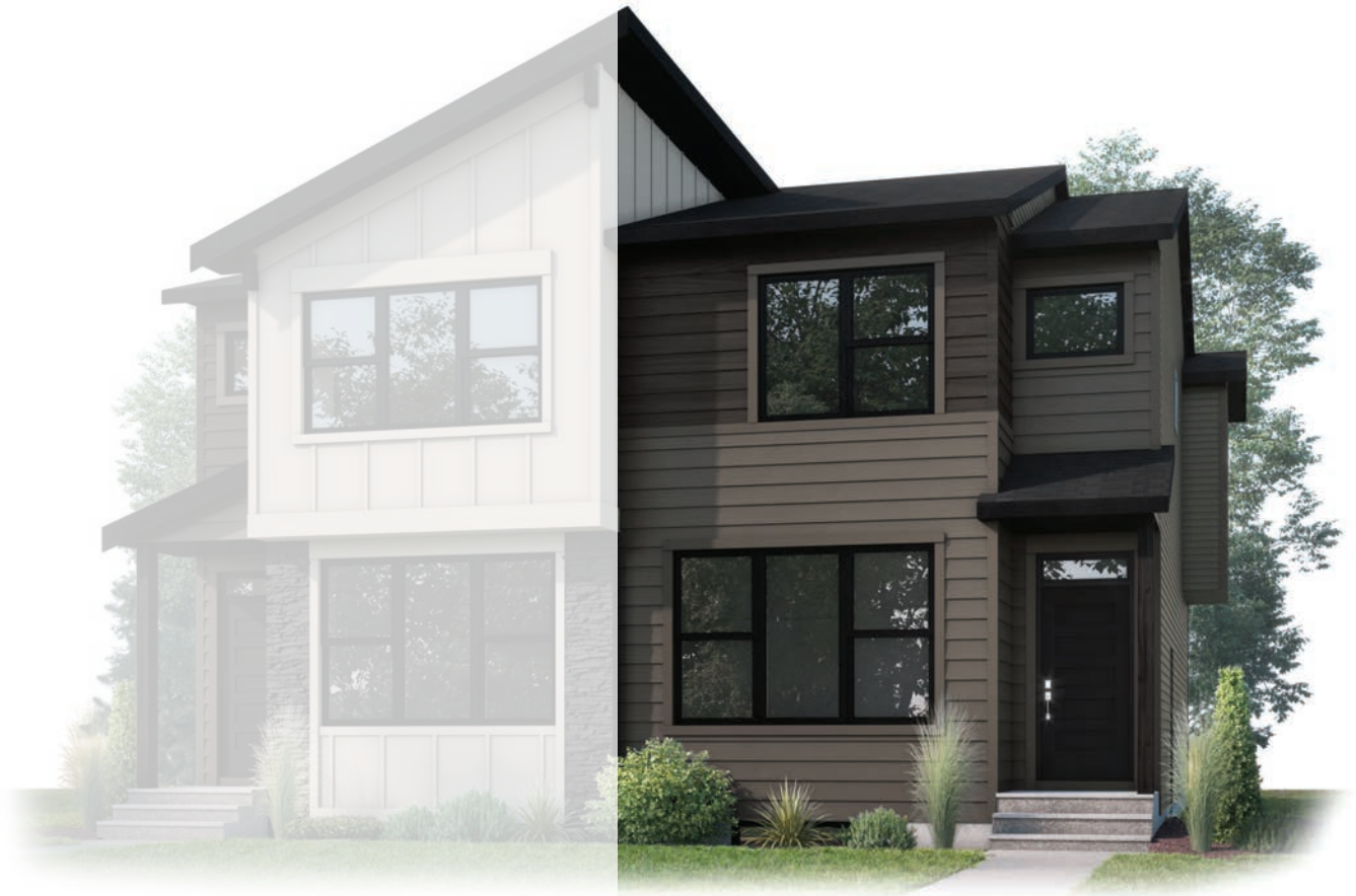
URBAN MOUNTAIN SL3