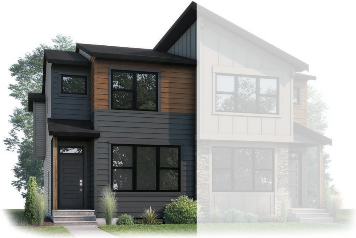
URBAN MOUNTAIN SL3