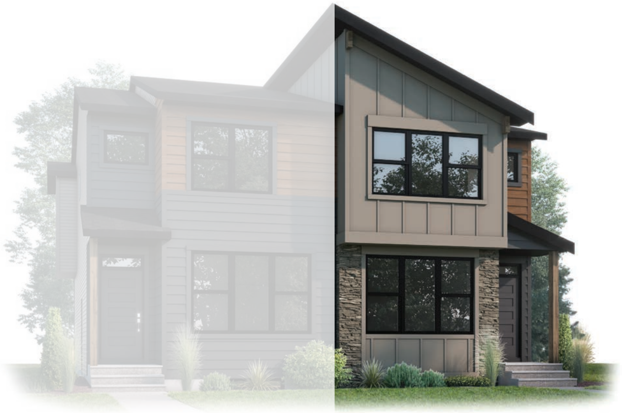
URBAN MOUNTAIN SL3