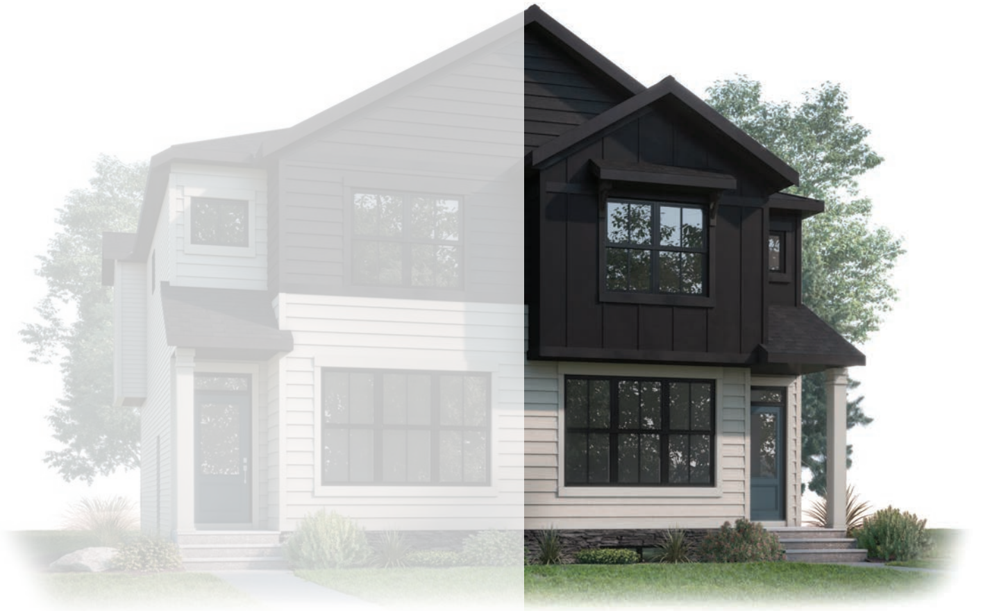
MODERN PRAIRIE SL4