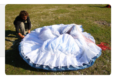
Step 2. Group LE reinforcements with the A tabs aligned, make sure the plastic reinforcements lay side by side.

Step 1 . Lay mushroomed wing on the ground. It is best to start from the mushroomed position as this reduces the dragging of the leading edge across the ground.