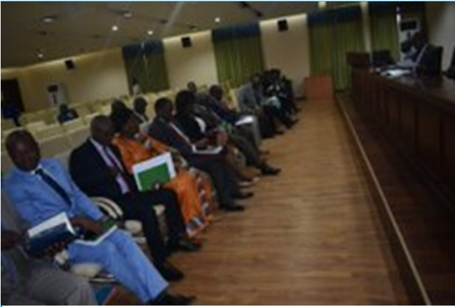
missions of Burundi abroad who were present, they all

appreciated and were happy for the organization and holding of this session.