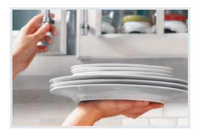
SaharaDry™ Technology There's no need to towel-dry before putting dishes away with the fanassisted SaharaDry™