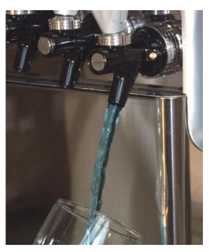
2. Cleansing agent comes out