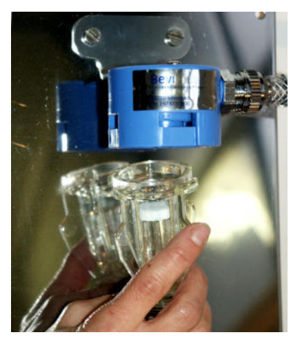
1. Detach the adapter sight glass and place Bevi Tab flat