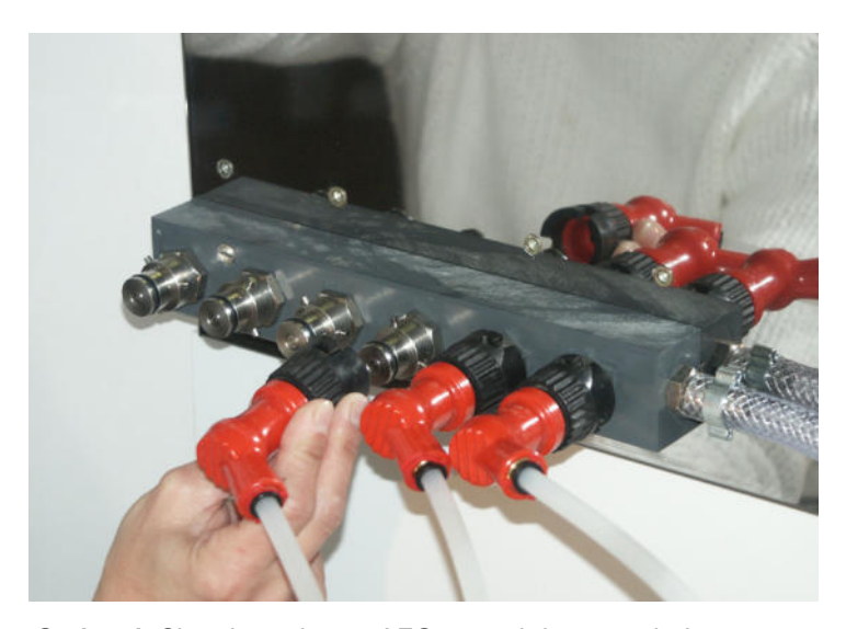
Optional: Cleaning adapter AFG on stainless steel plate