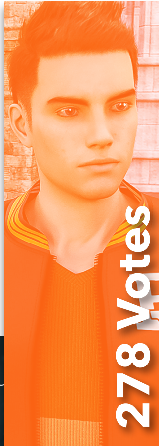
Being a DIK