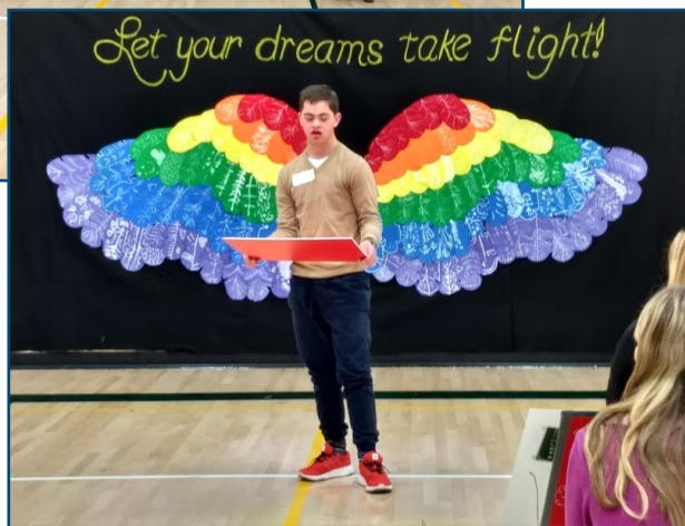
“DREAMS TO GOALS” WORKSHOP