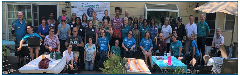
Volunteer Appreciation Picnic