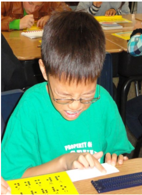
Student reading in Braille

“After going through all the stations today, I realize how much I take for granted every day. I know how lucky I am to have good eyesight, all my limbs, and be healthy. I understand how it takes so much courage for the disabled to overcome their disability and that they never give up. Also, I thought this was a great experience for the 5th-8th graders to learn about how disabled people feel when someone stares at them and the things they had to go through to learn how to speak, or walk, or just deal with life. I also was amazed by all the new inventions people have come up with to help them learn and get through their disabilities in their lives. I am so astonished by all of the stories these people shared with us about their life and how they overcame these difficult times. I learned they can do any sport they want, develop writing skills, and even have photographic memorization. I think as an 8th grader we should carry on this program with the younger kids so they will understand what to do and how to act when they are with someone that looks or acts different than them. It would help them to understand that it's okay to be different.” Eighth Grade Boy