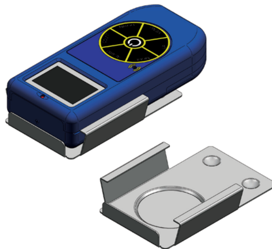
Wipe Test Plate