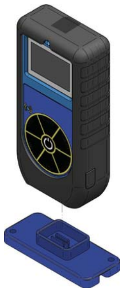
Ruggedized boot and Stand Included