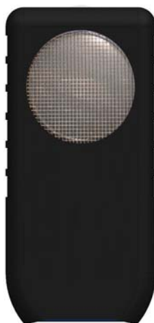
View of Back