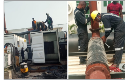
2.2 MVA BACKUP POWER GENERATORS (2 X 800KVA + 1 X 600 KVA) INSTALLATION AND MAINTENANCE