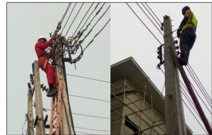
33KV & 415V OVERHEAD LINES CONSTRUCTION, SUBSTATION AND TRANSFORMER INSTALLATIONS